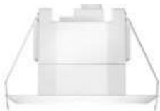
Theben theRonda Discrete slimline recessed Presence Detector