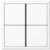
JUNG F40 Keypad 4 Button Keypad available in 75 Finishes with LED Status Feedback & Temperature