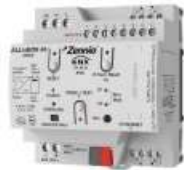
Zennio ZPR46 Multi-Function device fitted with a KNX PSU, IP Router, 4 Switching Channels, 6 Binary Input Channels and Logic.